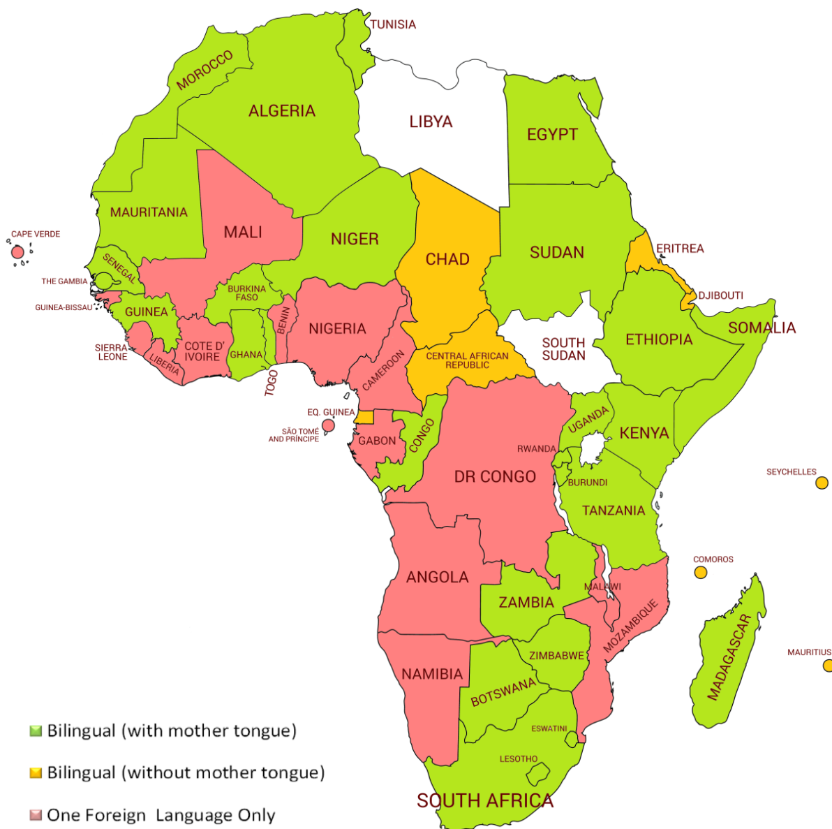
Figure 1: Mother tongue use in Africa -Recent and current situation

The figure above shows the distribution of mother tongue implementation in different African countries currently. It appears that the majority of African countries are using bilingual approach with the use of mother tongue, few countries such as Angola, Namibia, Democratic Republic of Congo and other countries -marked in red- only use one foreign language like English, French and Portuguese. Finally, countries such as Chad, Central African Republic, Eritrea and Djibouti are bilingual to multilingual. Moreover, as shown in the map, the distribution of countries with the same colors are mostly positioned in the same area which could explain that some of them may take overall decisions taking into account the political, economic and social development of the region. Countries in red are close to each other as Namibia, Angola and Dm.r 1 Congo which are part of EAC 2 and all using only one foreign language.