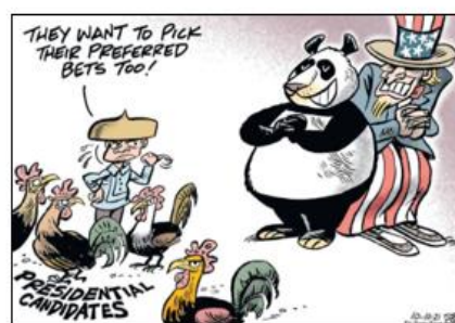
Fig 18. Elections

As what can be seen in this political cartoon, the signs present are the man wearing a Barong Tagalog, which connotes to the Filipino citizens, the roosters represent the presidential candidates, panda, which is a native bear to South Central China represents China, and a clown who wears a dress that resembles the American flag, which connotes the power of America. The man in barong is telling the roosters that the panda and the clown want to pick their preferred candidates for the election, too. The myth depicted in this cartoon is the influence of outside countries regarding the national election, specifically big and powerful countries such as China and America.