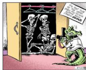
Fig 4. Skeletons in the Closet