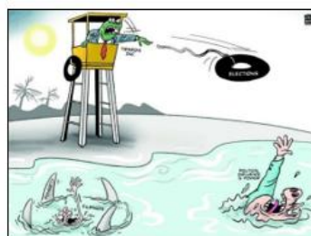
Fig 15. Trapos INC

The signifiers present in these political cartoons are the lion, pig, and alligator , which connotes the powerful, authoritative, and greedy politicians. The other signifiers, such as the mouse and a drowning man, represent two types of people: the ones working for these politicians and the ones who are part of the ordinary Filipino people, surrounded by the other signifier, shivers of shark, which connotes poverty. The cartoons portray two different scenarios in which the politicians can display their power: firstly, they are giving orders that they think could benefit people, but in actual work, little to none. Secondly, when the