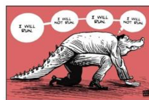
Fig 7. To run or not to run/