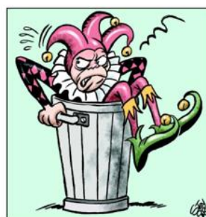
Fig 11. Changing the Senate