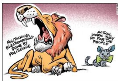
Fig 14. Politicking, Electioneering Done by Politicians