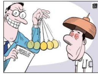
Fig 17. Surveys of Presidential Candidates

In Figure 3, one of the signifiers is the Bergens, a species of creatures that eats Trolls in the American computer-animated musical comedy, Trolls . In this context, it seems that the reference of Bergens is the Troll. The term "troll" is an internet slang referring to people who post inflammatory, insincere, off-topic, and often fallacious messages that provoke the readers in the online community. When these trolls provoke the online community, even ordinary people can behave like a troll, as factors such as personal mood and online discussion climate could also affect their behaviors (Cheng et al., 2017). In Figure 4, one of the signifiers is a pendulum, an object used for hypnotizing people. This pendulum connotes that one's situation can change depending on the direction of its swing. Another essential signifier in this cartoon is the man, wearing a salakot and a worn-out shirt with a patch, and is being hypnotized. This represents Filipino people who are being influenced by the surveys conducted by various organizations regarding their presidential bet. The myth that these cartoons depict, when it comes to choosing the candidate for them to vote for the coming elections, these people are often swayed with what has been projected in social media, without verifying the veracity of the information, even if it was just because of the internet trolls or actual people. Thus, their decision of whom to vote for the presidential election relies on what they have read or seen.