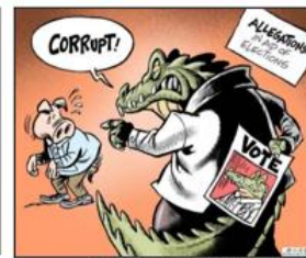
Fig 3. Allegations