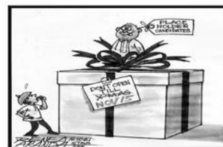
Fig 9. Placeholder

The figures above present another central myth in this study that shows that some politicians in the Philippines hide their true intentions when running for office. This myth can be supported by signifiers found in the four editorial cartoons above.