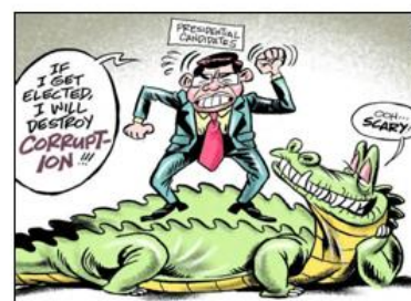
Fig 13. Presidential Candidates

Figures 12 and 13 show another major myth found in these political cartoons. These two figures show that election promises are always present every election. Figure 12, entitled empty promises, has four signifiers: the dancing women, the bowls of food, the sitting man, and