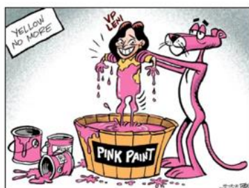
Fig 10. Pink Paint