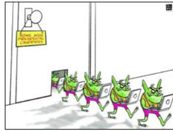
Fig 16. Some 2022 Presidential Candidates