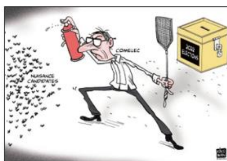
Fig 20. Nuisance Candidates

As seen in this figure, the identified signs are flies, man, insect repellent spray, fly swatter, and the ballot box. A fly is a common insect found in the household, which can be seriously annoying and dangerous as it can transmit diseases. In this context, it is labeled as nuisance candidates, representing any candidate who mocks the electoral process by having