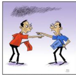
Fig 1. Dear Voter, look beyond colors and ask for platforms