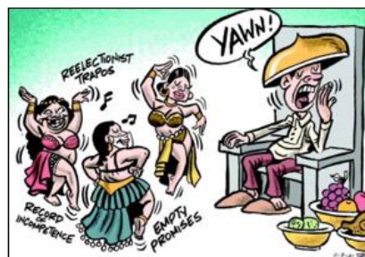
Fig 12. Empty Promises