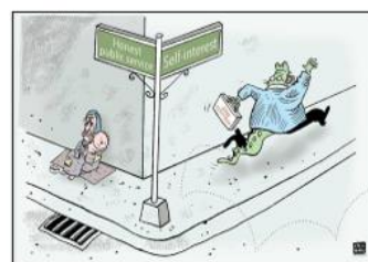
Fig 8. Wrong Turn