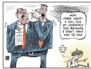
Fig 2. Certificate of Candidacy