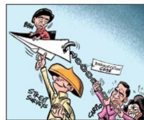
Fig 5. Pulling BBM Down

The figures above show one of the significant myths found in this study. The political feud among clans and political parties is present in every election. Figure 1 shows the different signifiers like Man in Red denote that the man who wears a red shirt is the A Party and has a connotation that this man represents a political party. Another signifier present in Figure 1 is Man in Blue, which denotes that the man who wears a blue shirt is the B Party and has a connotation that this man represents another political party. Fingers pointing at each other is another signifier that denotes the finger-pointing describing someone. Thus, it connotes that both parties are accusing and throwing shades at each other. Lastly, Figure 1 presents a signifier of angry expressions. This expression denotes an intense feeling of abhor and hate between or among political parties. Furthermore, this signifier connotes that one party is wrongly/falsely accused of something, which becomes the reason why they are angry or vice versa. Based on the signifiers and their denotational and connotational meanings, Figure 1 shows that political parties in the Philippines are throwing issues at each other, making people focus on the issues thrown at each other and not on their respective platforms that lead to Political feud.