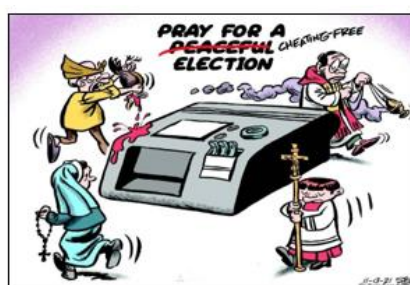
Fig 19. Pray for a Peaceful Election

As shown in Figure 19, the signifiers are the machine, the quack doctor, and some members of the Catholic church: the priest, the nun, and the sacristan. The machine in this cartoon connotes the PCOS machine used by the Commission on Elections during the elections. The quack doctor uses a chicken's blood as a sacrifice to carry out his enchantment. The Catholic church members, being the largest religious group and having a vast number of members, represent the religious groups. As presupposed from the text, pray for a cheating-free election . There have been cases of cheating in the electoral process in the Philippines. The myth drawn out from this cartoon is that the election has never been that clean. Regardless of whatever system is used in the election, from the manual to the electronic casting of votes, there is always cheating. Thus, these people are utilizing means, such as asking for divine interventions, to ensure that the upcoming election would not be corrupted.