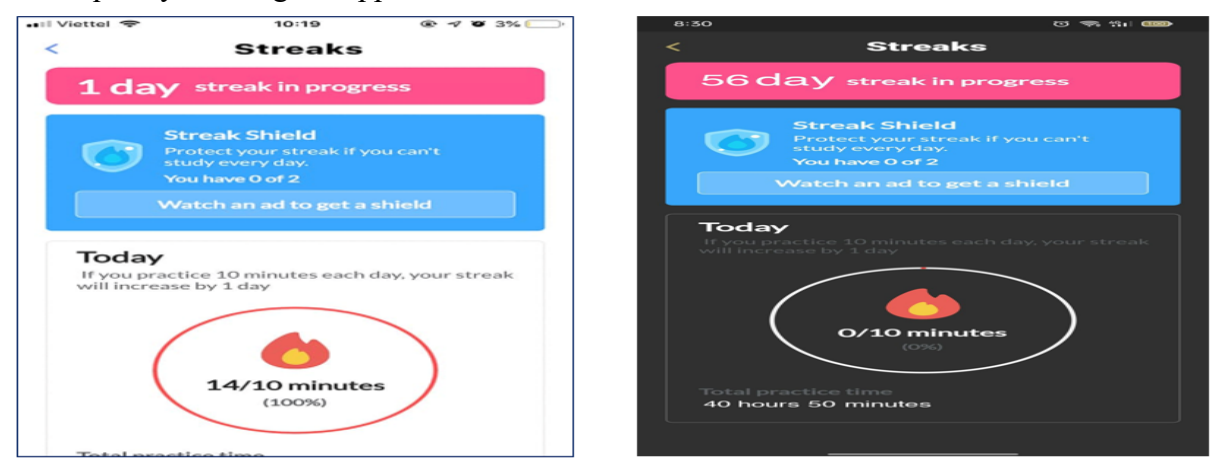
Figure 3: Counting from day 1 to day 56 using on the application "Hallo"

This application can count the number of days (called "streak in progress" on Hallo) that users speak English with others via "1-on-1 conversation" if the length of time for each conversation is over 10 minutes (figure 3). When users complete the more than 10-minute conversation, the app will count one day of "streak in progress", which allows the users and the teacher to follow the frequency of using the application "Hallo".